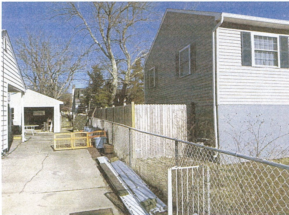
LEFT SIDE VIEW FROM FRONT