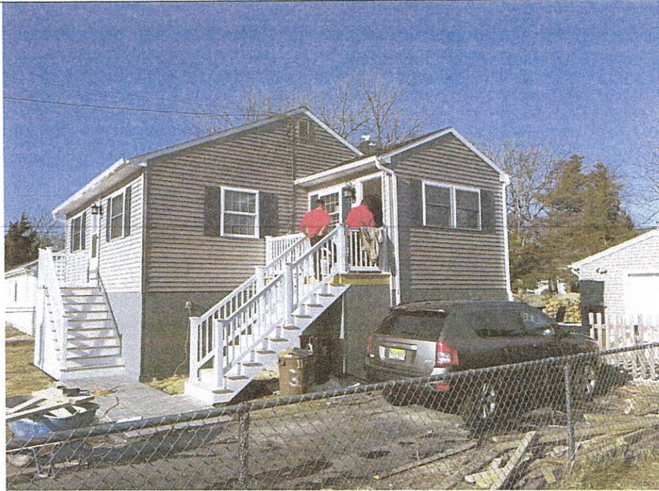
RIGHT SIDE VIEW FROM FRONT

If submitting more photographs than will fit on the preceding page, affix the additional photographs below. Identify all photographs with: date taken; "Front View" and "Rear View"; and, if required, "Right Side View" and "Left Side View." When applicable, photographs must show the foundation with representative examples of the flood openings or vents, as indicated in Section A8.